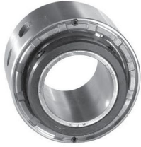
Photo Shows a Spherical Roller Bearing Cartridge Unit with Steel Housing